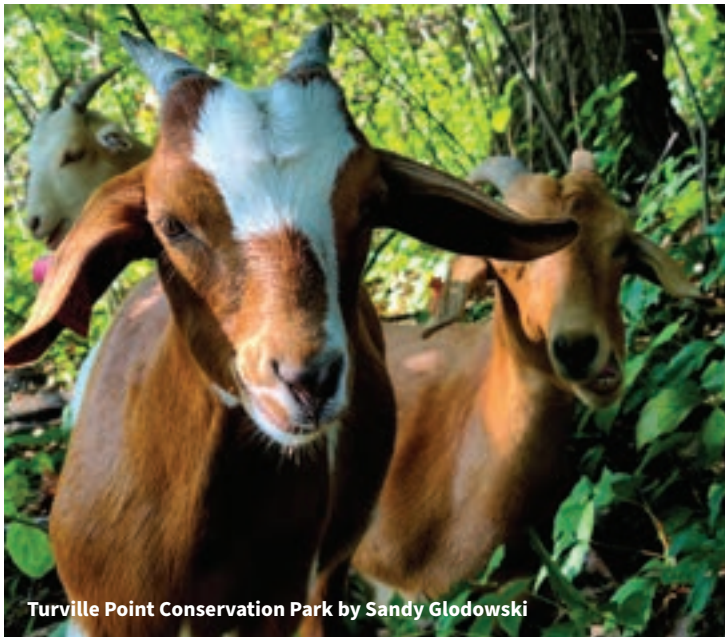
Turville Point Conservation Park by Sandy Glodowski